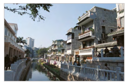
A street and water channel after reconstruction