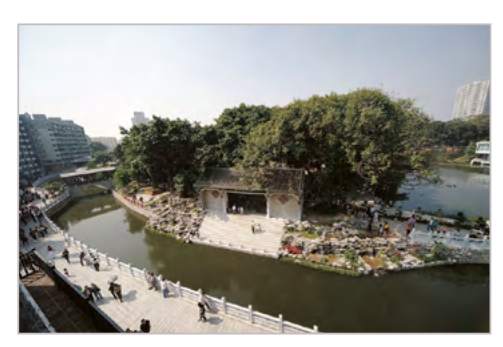
South Gate of Litchi Park after reconstruction