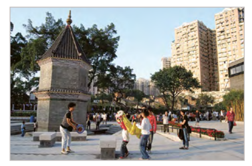
Wenta square after reconstruction