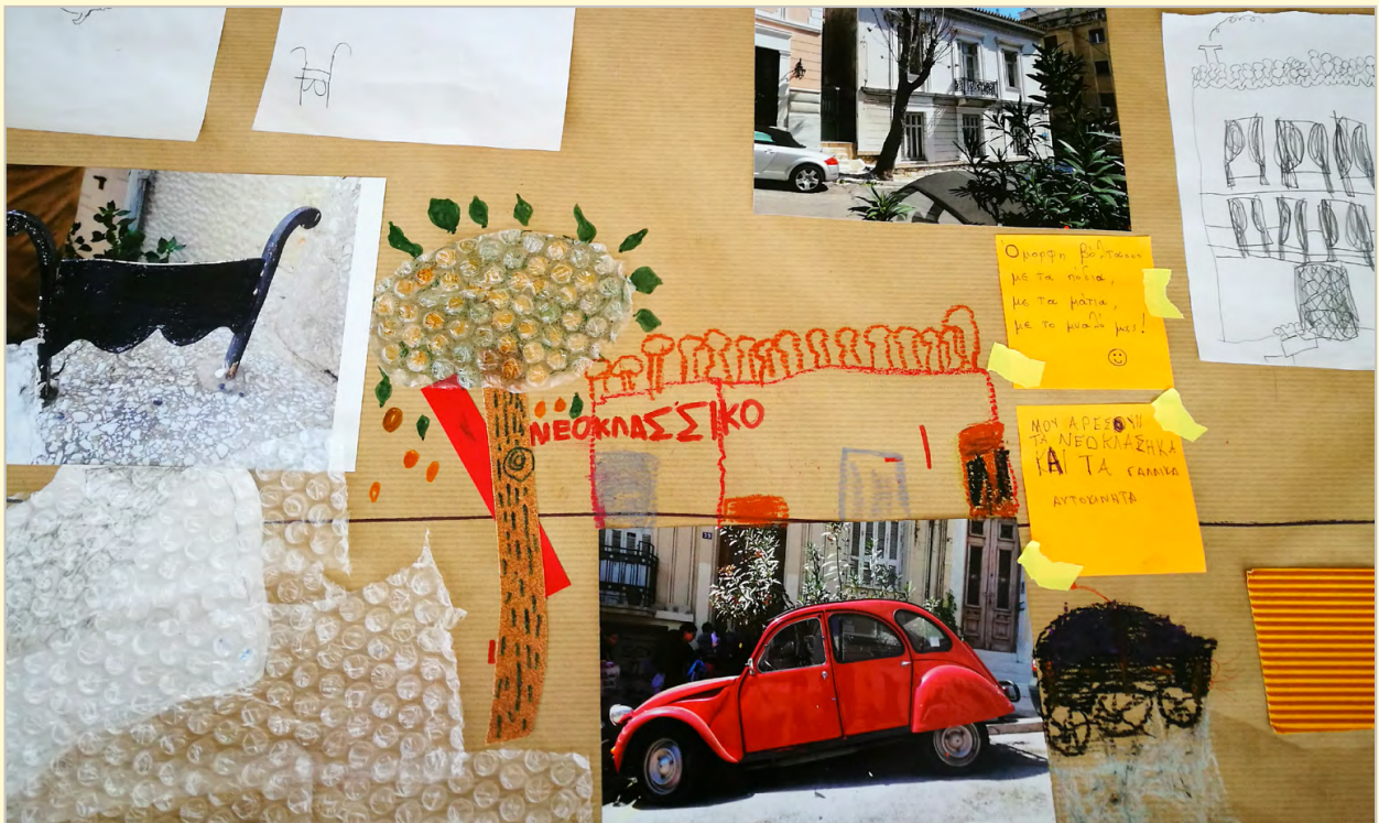
Snapshot of the mental map