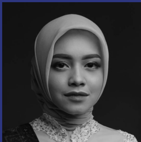
Feysa Poetry (Arte Polis, Indonesia)